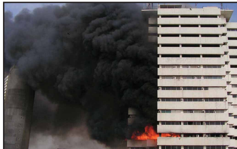
Building Fire Detection