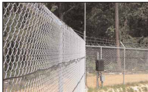
Border Security Monitoring

See our technical paper on Crack Detection.