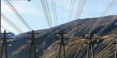
Power Line Monitoring

See our technical paper on Power Line Monitoring.