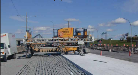
Highway Safety Monitoring

See our technical paper on Crack Detection.