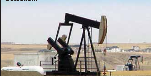
Oil and Gas Well Monitoring

See our technical paper on Pipeline Corrosion Detection.