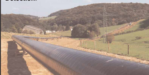
Oil and Gas Pipeline Monitoring

See our technical paper on Pipeline Buckling Detection.